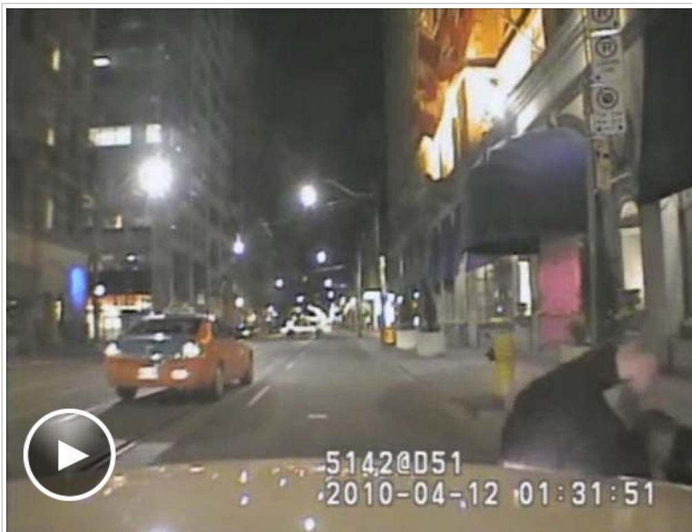
Video: Police surveillance

Email | Print | Share | 6 | [social icons]